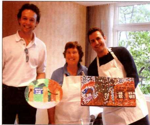
Two of the Genentech painters display their work.

Another creative teaching challenge for me this summer was leading a team building painting project for Genentech's Xolair Marketing Group during their retreat in Sausalito. The goal was to help team members with vastly different art experience manage visual chaos by working together to create a cooperative artwork. Given a choice of painting water, sky or land, team members worked on canvases of different shapes and sizes to be later displayed together in tiers-- creating a panorama of the Sausalito waterfront.