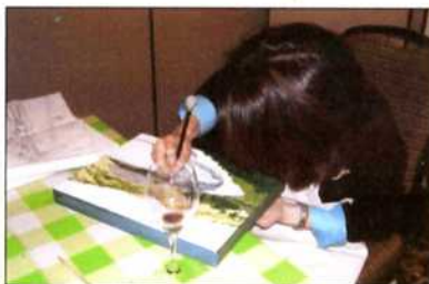
About half-way done...