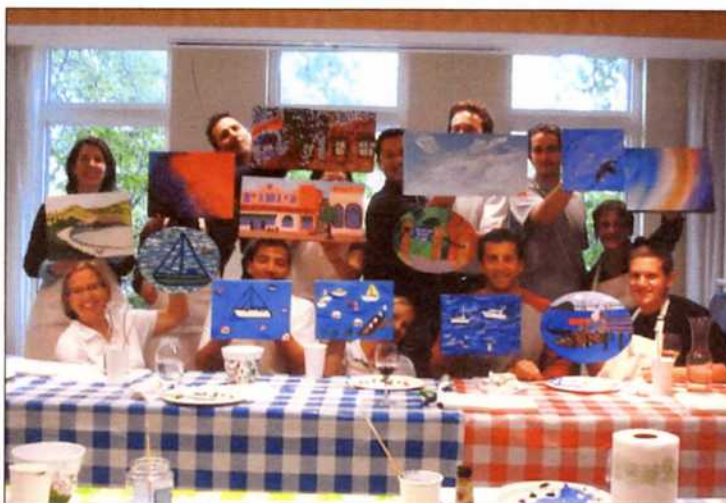
Genentech's Xolair Marketing group shows off their panorama of Sausalito waterfront in tiers of water, land and sky.