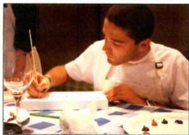
Beginning an acrylic painting...