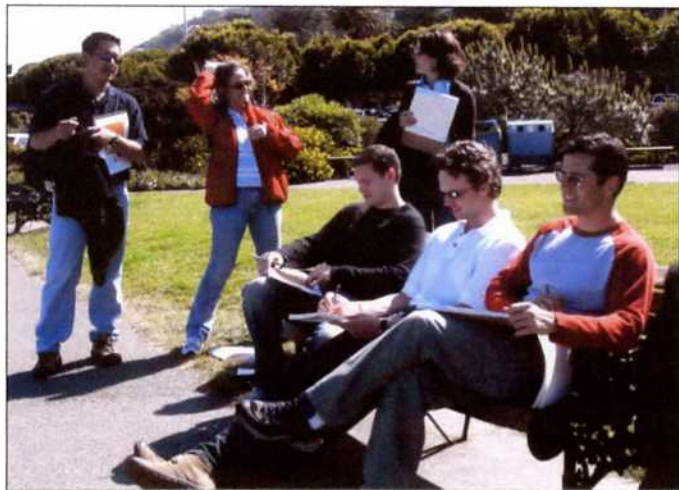
Group sketching session in Sausalito's Gabrielson Park, April 2005

They began with an hour sketching session in the park, and finished up with a two hour painting session at an improvised art studio in the Casa Madrone hotel. Here, I helped them transfer their sketches to canvas and transform them into acrylic paintings. The group was able to create a vibrant artwork that expressed their energy and creativity both individually and as a team – and gave them all a sense of great accomplishment – achieving what they didn't think they could do.