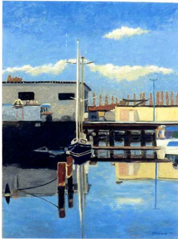
Sausalito Boat and Pier, 24" x 18" Oil on canvas with silver wood frame...$690 Matted print 10" x 8" ...$24

Many Sausalitans live in houseboat communities populating long piers with glorious views on all sides. Houseboat architecture ranges from the ramshackle to the palatial – with everything in between. Victorian era “arc houses” also sit on the dock of the Bay.