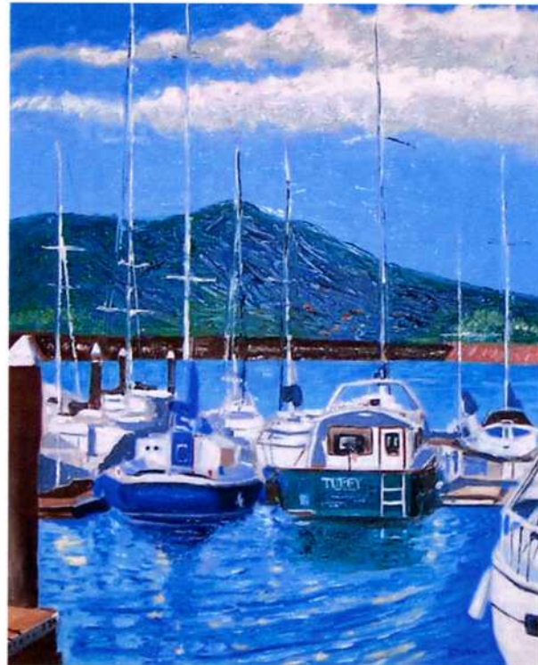
Sausalito Boats, 20" x 16" Oil on canvas with silver wood frame...$645 Framed giclée print on canvas...$225

Water and skies are two of my favorite subjects and boats are the perfect focus to paint both. Boats are often stunningly mirrored by reflections in calm water and light by the water is ever-changing. Reflections create mood and movement.