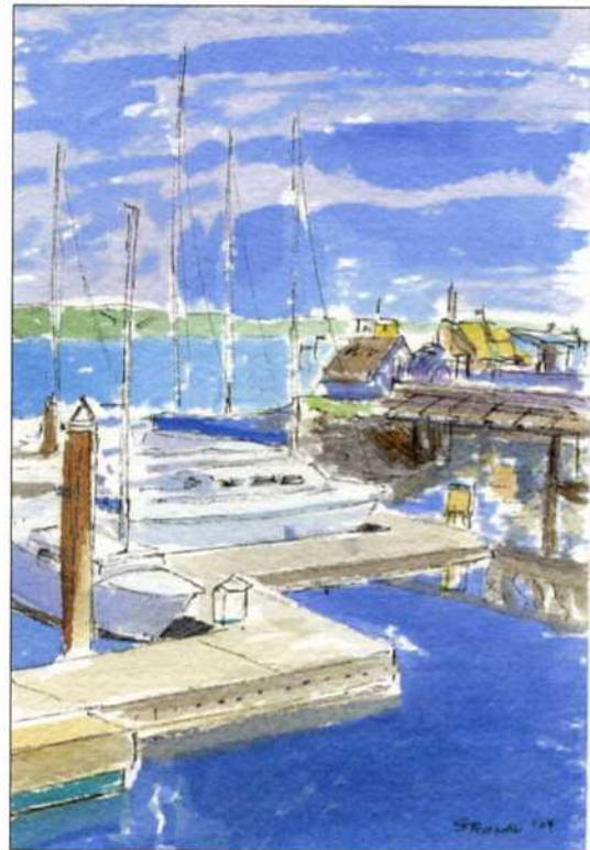
Sausalito Marina, 8" x 10" Watercolor with gold metal frame...$135

Sausalito is teeming with boats. Numerous sailboats dot the Bay on sunny weekends. Marinas lining Sausalito's long waterfront are crammed with boats in all shapes and sizes, from a wooden tug, to a yacht named "Why Walk."