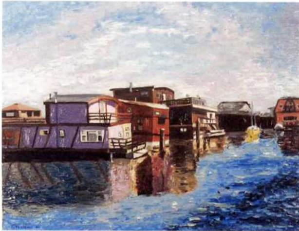
Sausalito Houseboats — Lowtide, 16" x 20" Oil on canvas with silver wood frame...$645

During the Gold Rush , ships would stop in Sausalito to take on fresh spring water and beef from local ranches. Somewhat smaller boats were used to dip under the watchful eye of the lawmen during Prohibition. During World War Two, many a bottle was broken over the bows of the Liberty Ships built and launched in Sausalito.