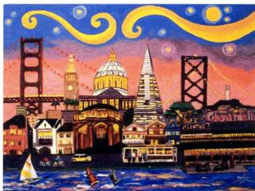
San Francisco Night oil on canvas 18 x24 $690

I wanted to paint a tribute to New York’s past and also the reality of its present without the Twin Towers. Oddly, my inspiration was sparked by a trip to Las Vegas where I saw the New York-New York Hotel & Casino for the first time.