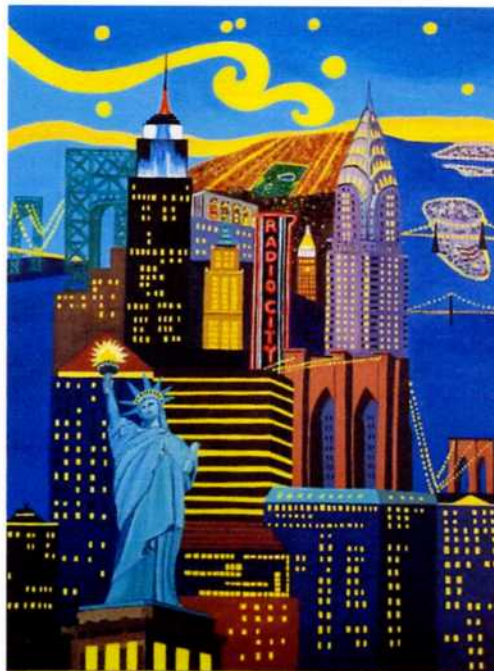
New York Night oil on canvas $1490

I grew up in Manhattan and remember taking the subway downtown with my mother to watch the building of the World Trade Center. I was affected deeply and personally by the tragedy of 9/11. Many artists reacted almost instantly with plays, songs, and artwork. Frankly, I couldn’t get past the imagery from TV of the crumbling towers – and I couldn’t respond as an artist. But by the spring of 2003 I knew I wanted to make a painting that would celebrate New York City – my New York – the city I grew up with, not the wounded city portrayed repeatedly in the media. I began to think of the act of creating this painting as a way to heal myself and my mental image of the city, and as a way to reach out to others who felt the same hurt.