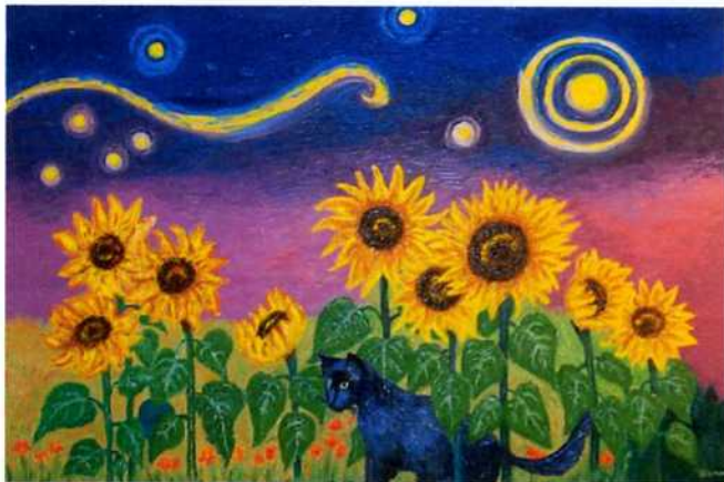
Sunflower Night oil on canvas 24 x 36 $1290

It seemed only natural to continue the series with San Francisco, my adopted hometown. Sausalito Night and Sunflower Night , two additional images in this fantasy series were completed in 2004. In Sausalito Night fog creeps over the hills and a particular cat (our Princess) lurks in a field in Sunflower Night , with a nod to the primitive paintings of Henri Rousseau.